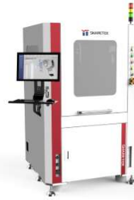
Die attached bonder