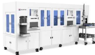
Cutting and Bending Equipment