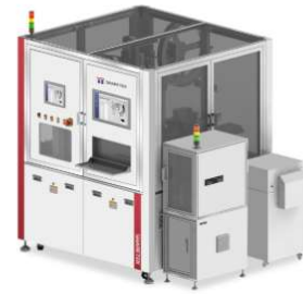
Automatic Pin Placement