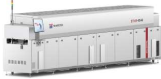
Vacuum Reflow Oven