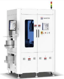
Tray Changer for Substrate/Base Plate