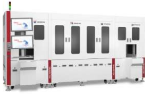
KGD Test Handler