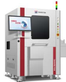
Fully Automated Pre-sintering Equipment