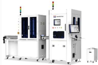
Base Plate Marking Machine