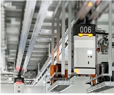
Logistics Automation OHT/AGV Integration