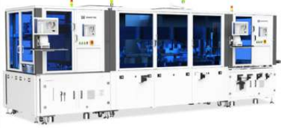
IGBT Module Dynamic and Static Test Automation Production Line