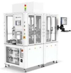
DBC Slitting Machine