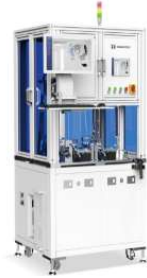
Camber Measuring Equipment