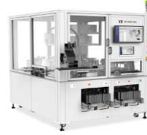
Module Cover Assembly Equipment