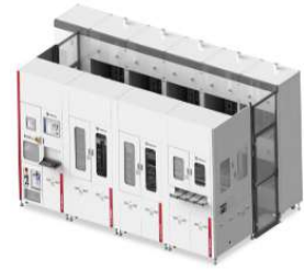
HTRB Test System