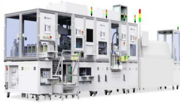
Automatic Module Bonding Machine