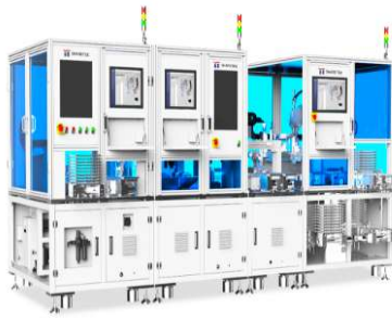
Frame Assembly System