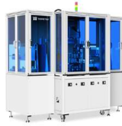
IGBT Substrate Dynamic and Static Test Automation Production Cell