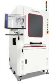
3D Wire Bonding Defect AOI Equipment