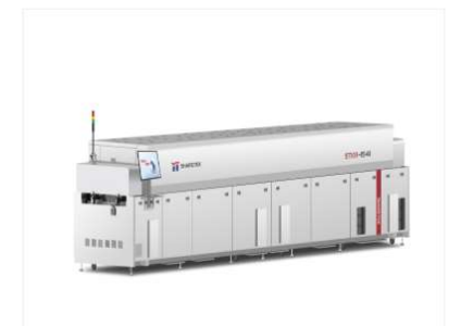
Vacuum Reflow Oven