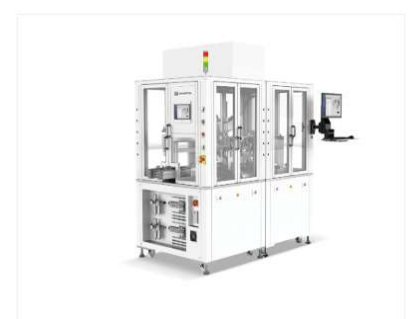
DBC Slitting Machine