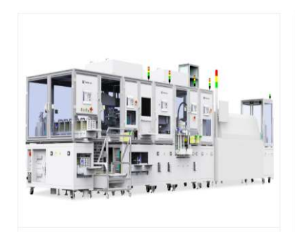
Automatic Module Bonding Machine