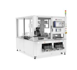
Module Cover Assembly Equipment