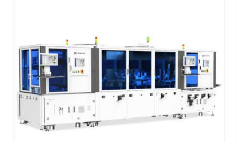
IGBT Module Dynamic and Static Test Automation Production Line