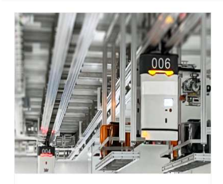
Logistics Automation OHT/AGV Integration