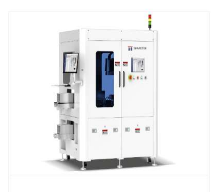
Tray Changer for Substrate/Base Plate