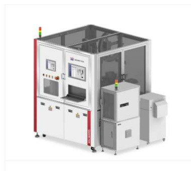
Automatic Pin Placement