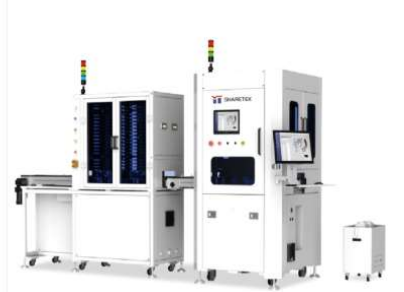
Base Plate Marking Machine