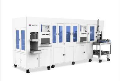
Cutting and Bending Equipment