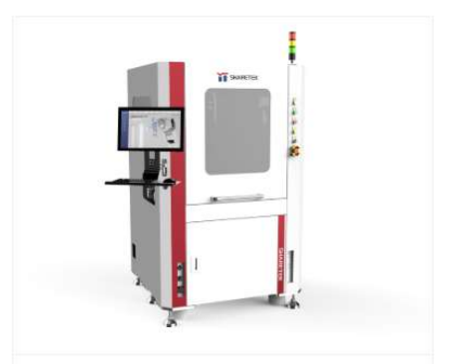
Die attached bonder