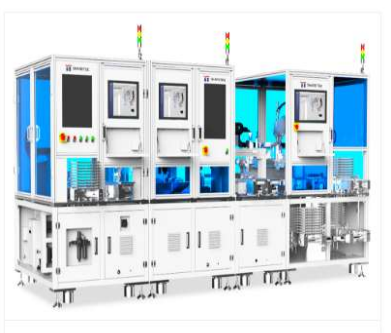
Frame Assembly System